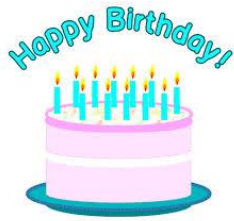
Lynn Ruddle January 25th